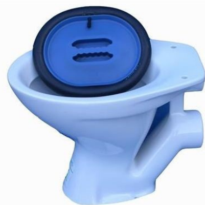
Toilet pan seal / JT Atkinson