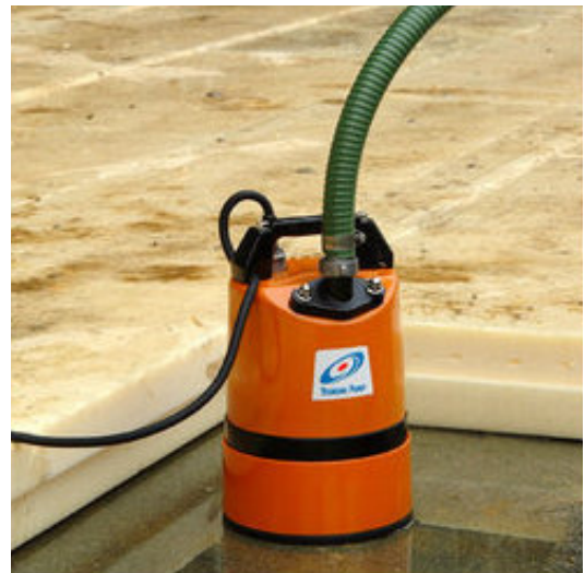
Puddle sucker pump / National tool hire shops