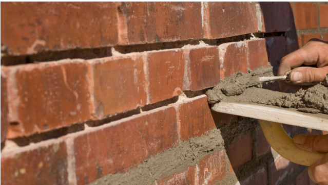
Repointing / The Spruce