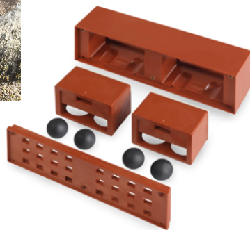
Air brick exploded view / StormMeister