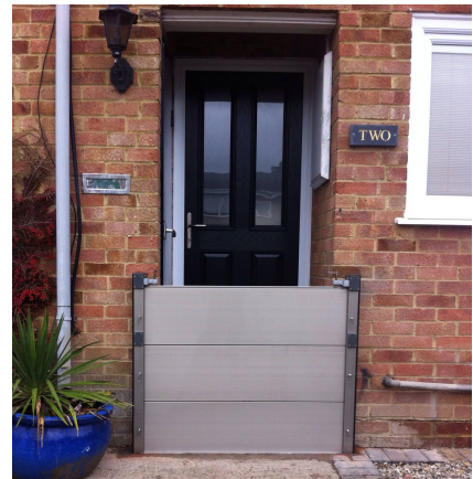
Flood barrier / Lakeside Flood Solutions

Some barriers are designed to be installed within the doorway reveal on inwards opening doors and without the need for channels, and they expand to create a seal with the floor and masonry.