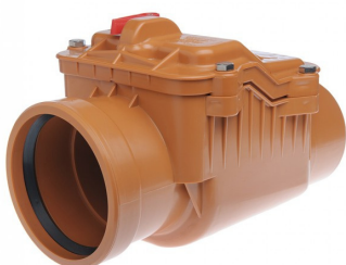
Non-return valve / drain depot

Est. Costs: Small wastewater NRVs from £15 plus installation, flap gates from £25, and in-line NRVs from £200 plus installation.