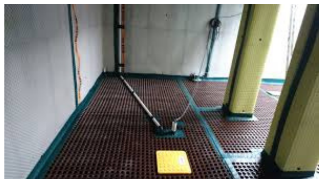
Cavity drain membrane system / Preservation Treatments

Est. Costs: Expensive and dependant on size of basement.