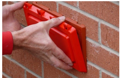
Air brick cover / The Flood Company

Est. Costs: £30 for a single cover and £20 for a pack of 2 adhesive patches.