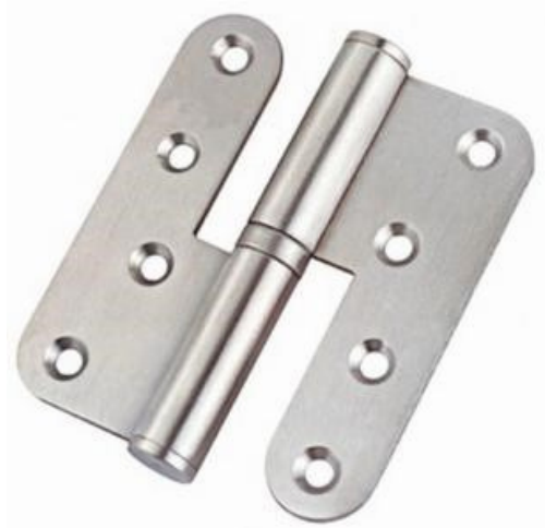
Quick release door hinge / tttnet

Est. Costs: Quick release hinges £10-20. Hardwood doors £50-100. uPVC skirting boards £10-20 per board.