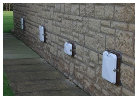
Vent covers / Floodguards